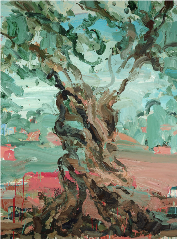
'The Tree Within, A Palestinian Olive Tree' series by Tagreed Darghouth

The paintings of tree stumps are particularly moving in contrast with Darghouth's paintings of flourishing trees, topped with canopies of silvery leaves. These works recall van Gogh's description of the olive trees of Provence. "They are old silver, sometimes with more blue in them, sometimes greenish, bronzed, fading white above a soil which is yellow, pink, violet tinted orange," he wrote to his brother, adding that the "rustle of the olive grove has something very secret in it, and immensely old. It is too beautiful for us to dare to paint it or to be able to imagine it".