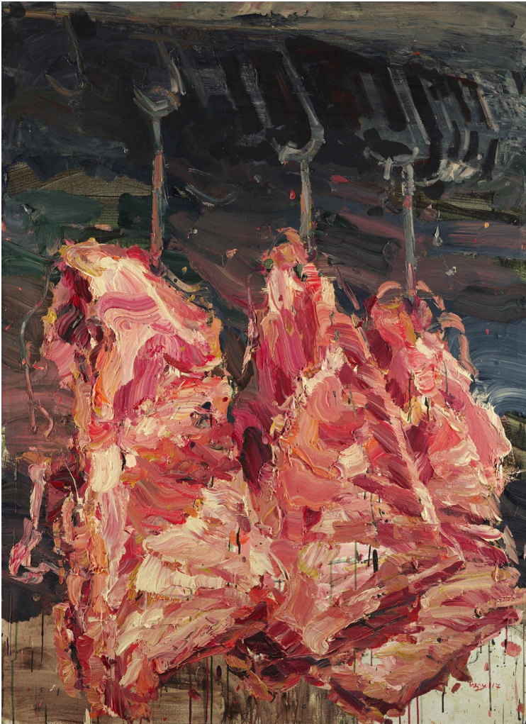
From Tagreed Darghouth's Piece of Meat series

Darghouth has offset the visceral pinks and reds of her meat paintings with shades of mint and sky blue, softening the violence of the images while also evoking the colours of her olive trees in a way that draws disturbing links between the subjects. She also scrutinises the tools of violence, picking out meat mincers in shades of olive green and brown and painting an F-16 fighter plane atop a bloody red backdrop that evokes the glow of flame but is in fact the remnants of one of her earlier studies of raw meat.